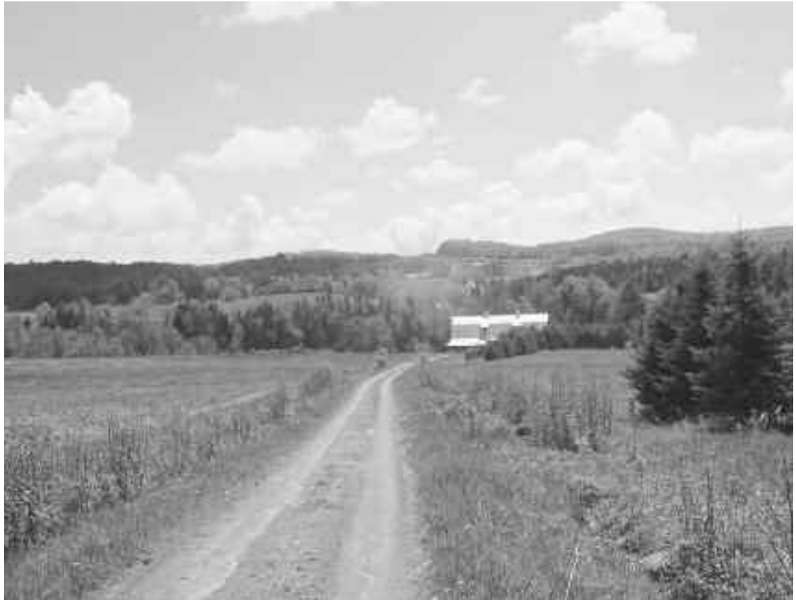
Crafting nativeness in Craftsbury: the author's farm

For the past sixteen months, as part of developing a new course for Sterling College, where I teach, I've been slowly making clothes. Garments straight from the soil of Vermont, from this ground that I love—from pastures, forests, roadsides, overgrown fields. I have washed, carded, spun, knitted, woven, and felted wool from Craftsbury sheep. I'm working with local llama fiber, alpaca, and mohair. I've gathered milkweed, dogbane, and nettle to experiment with the beautiful and strong fibers found in the stalks of those plants, and have grown flax. I have tanned the hides of deer and stillborn calves to make buckskin clothing and leather for shoes. We could do much more here to supply one of the most basic human needs—clothing—from local resources. This has become very nearly a thing of the past: our clothes are made of cotton, wool, silk, leather, nylon, polyester, acrylic, whatever, grown/raised/extracted, and processed and assembled we know not where or by whom, with unaccountable environmental and social costs. Could we change this just a little bit? Could Vermonters produce locally more of