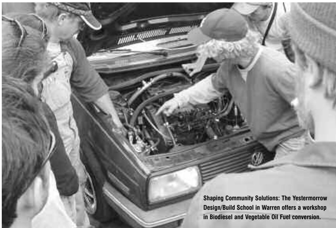
Shaping Community Solutions: The Yestermorrow Design/Build School in Warren offers a workshop in Biodiesel and Vegetable Oil Fuel conversion.

In his essay on Kipling, George Orwell wrote: “All left-wing parties in the highly industrialized countries are at bottom a sham, because they make it their business to fight against something which they do not really wish to destroy. They have internationalist aims, and at the same time they struggle to keep up a standard of life with which those aims are incompatible. We all live by robbing Asiatic coolies, and those of us who are ‘enlightened’ all maintain that those coolies ought